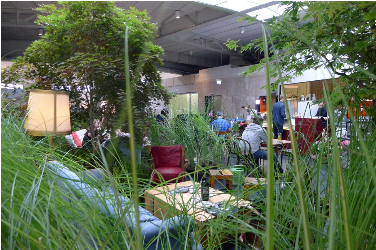
MEYERS CULINARIUM at the Volta satellite fair in Basel's Markthalle.

At the Volta show in the market hall a living room area beckons, at Art Unlimited all the hammocks of the Brazilian artists' collective Opavivará! are constantly in use. "Do We Dream Under The Same Sky" is Rikrit Tiravanija's culinary project under the bamboo roof on Messeplatz.