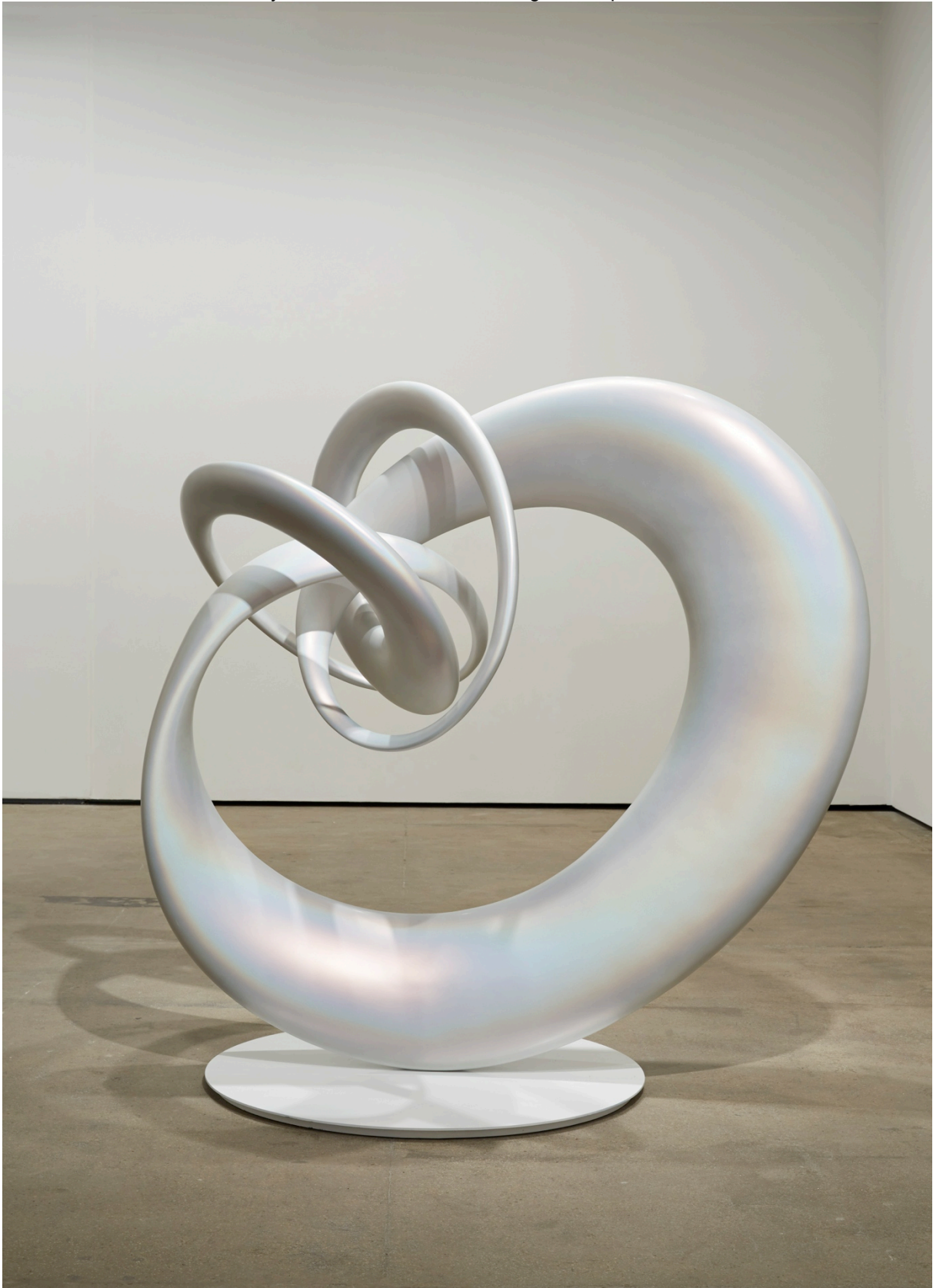
MARIKO MORI, Ekpyrotic String III, 2014 aluminum, paint and lacquer, 196.3 x 196.3 x 107 cm

“What we see is only a tiny part of what is possible” (Mariko Mori in Milk Made): The Japanese artist combines aesthetics with science, technology, spirituality, nature. She used to materialize her fantasies in wave UFOs, today she also does this in entangled sculptures.