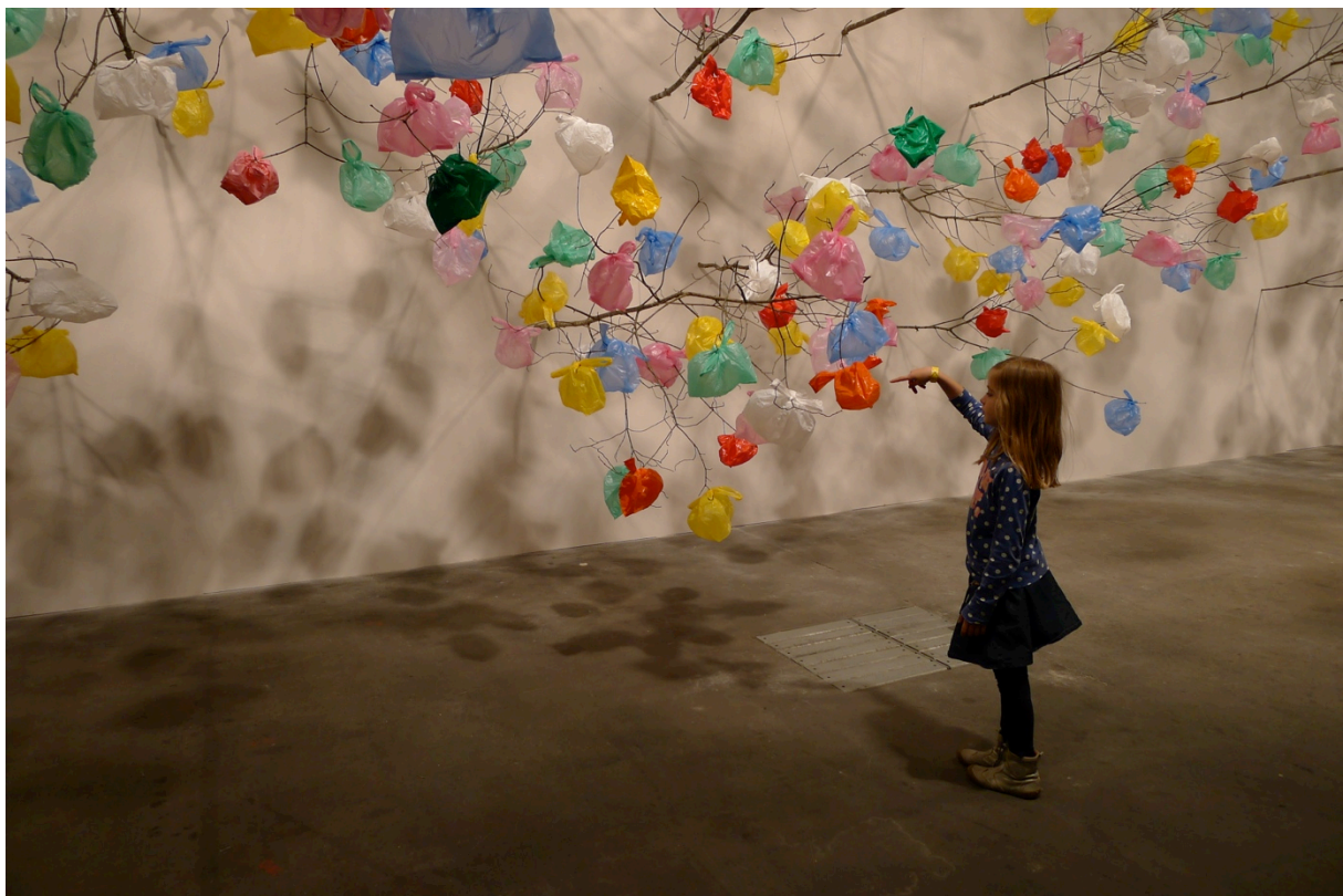
PASCALE MARTHINE TAYOU, Plastic Tree, 2014, branches, plastic bags; dimensions variable.

The artist from Cameroon conjures himself into consciousness with colorful plastic on barren branches: What kind of nature do we want to have in the future?